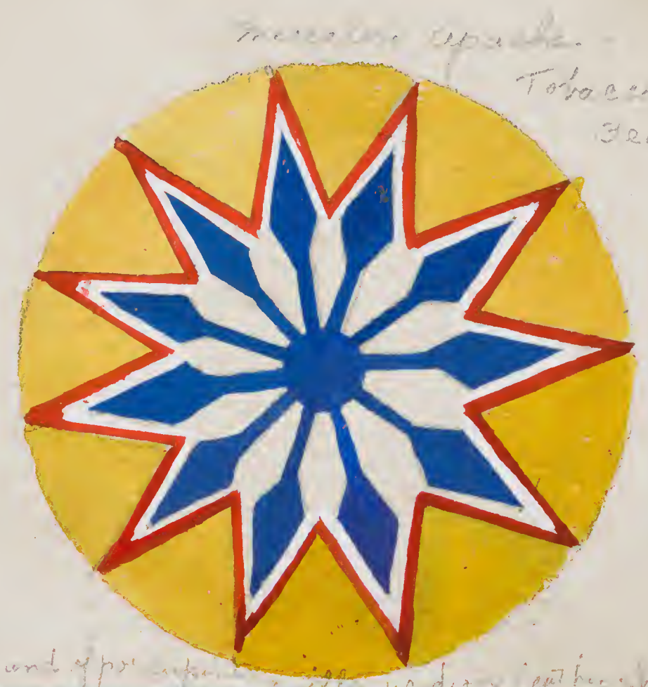
Tobacco smoking Beadwork.